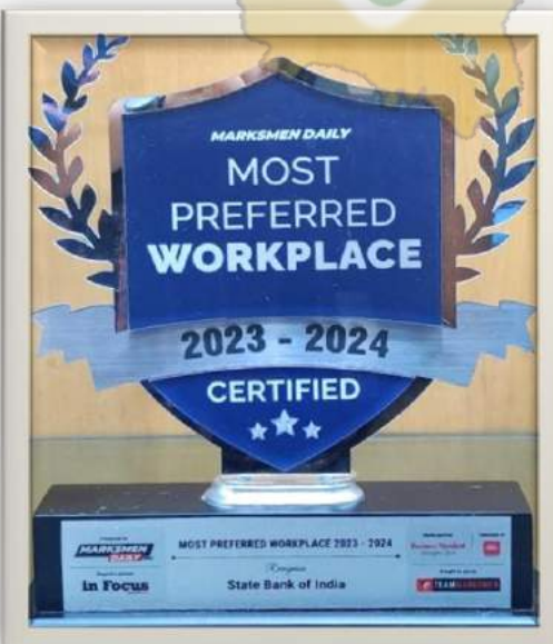
MARKSMEN DAILY AWARDS Most Preferred Workplace 2023-24