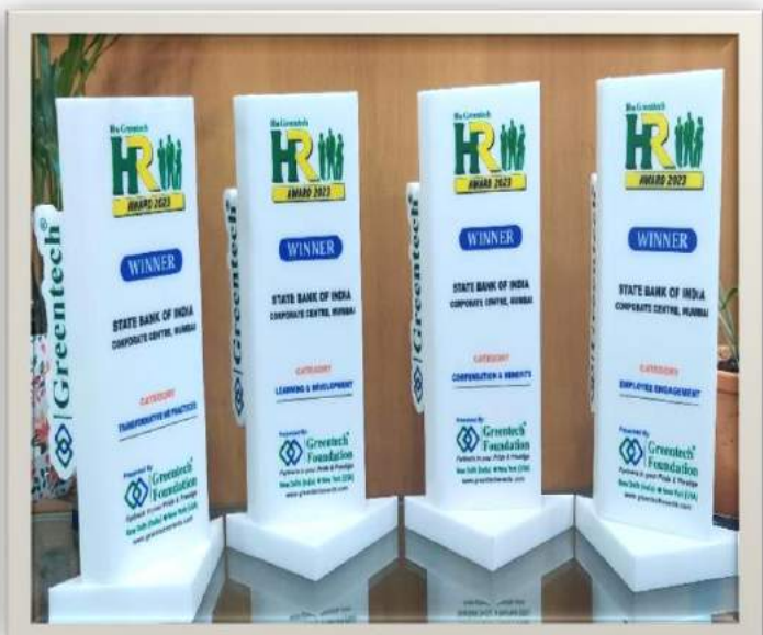
GREENTECH HR AWARDS 2023 ➤ Transformative HR Practices Award ➤ Employee Engagement Award ➤ Learning & Development Award ➤ Compensation & Benefits Award