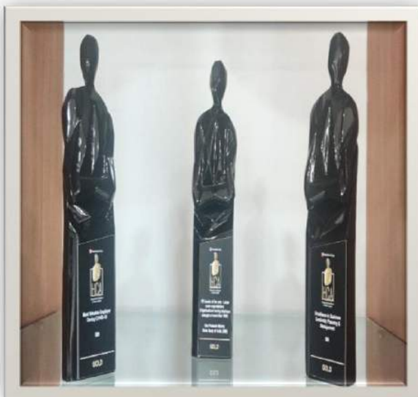
ET HUMAN CAPITAL AWARDS ➤ HR Leader of the Year – Large Scale Organization ➤ Excellence in Business Continuity Planning & Management ➤ Most Valuable Employer during COVID 19